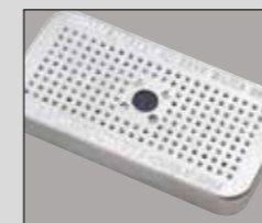
Peli Desiccant (Silica Gel)