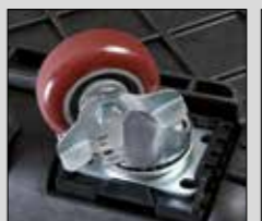
Caster Wheel Kit